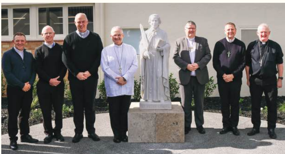
The New Zealand bishops, with Apostolic Nuncio Archbishop Gábor Pintér, at the blessing of the new statue of St Peter Chanel at Hamilton's new diocesan offices.

"But we also look at ways in which we can better serve our people – laity, priests and consecrated – and contribute to the national debate."